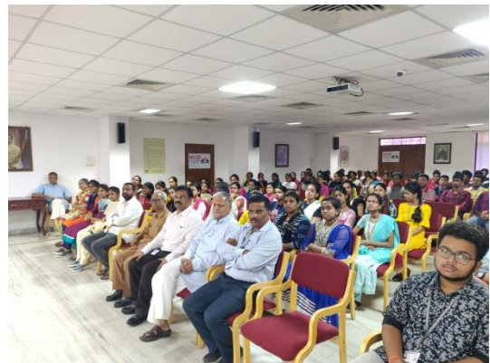
Participants of the Session