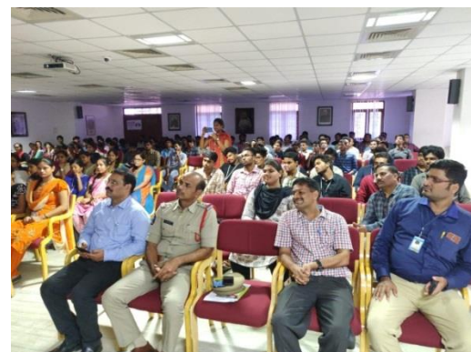
Participants of the Session