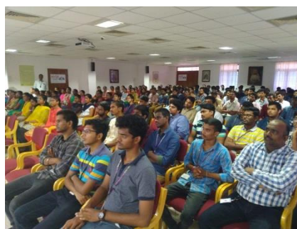
Participants of the Session