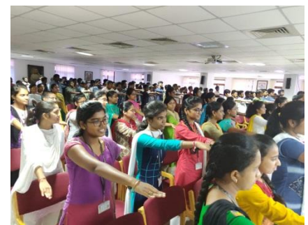
Students taking Oath