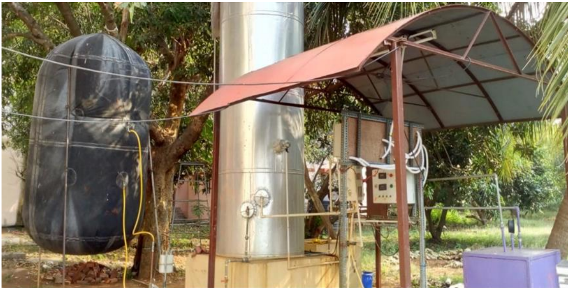
Fig.1 Layout of BENA-KA-MVGR Biogas Plant