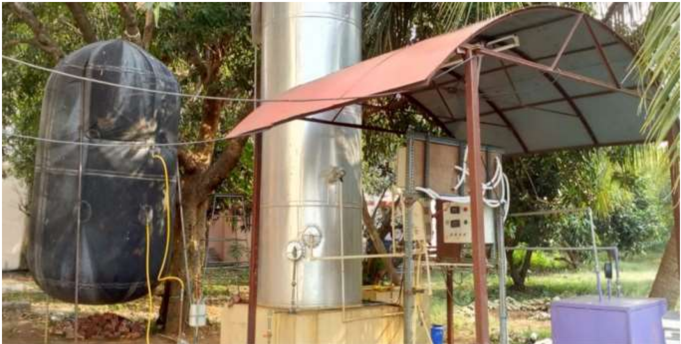
FIG: Biogas Plat at MVGR College of Engineering

The biogas plant at MVGR college of Engineering was an anaerobic digester which has a capacity of 3 tons. The digester works under anaerobic conditions. The feed of the digester was Kitchen waste, food waste and cow dung. The daily feed of the digester was 150 kg and the retention time is 15-20 days. The salient features of the digester are its bubble gun technology (generating gas bubbles) for mixing the slurry of the digester. Another important feature of the digester is it works under constant operating temperature of 35°C. The feed (kitchen waste/food waste) is crushed into small fine pieces and fed into the digester through Peristaltic Pump. Part of the gas produced from the digester was used to generate bubbles with bubble gun. Solar water heating was used for the hot water circulation inside column of the digester to keep temperature of the digester constant. The biogas produced from the digester was taken by the water ring compressor and sent to the water gas separator where the moisture in the biogas was removed and the dry biogas was sent to the storage balloon.